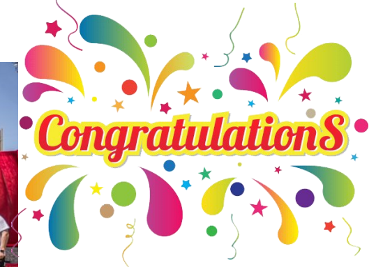
To our LADYCATS for a great Basketball season and Number 2 in the country!